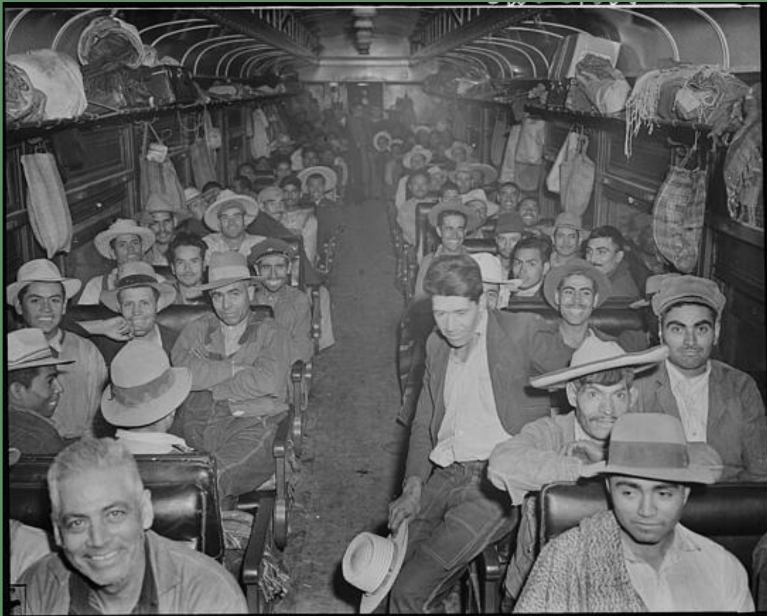
“Mexican workers recruited and brought to the Arkansas valley, Colorado, Nebraska and Minnesota by the FSA (Farm Security Administration), to harvest and process sugar beets under contract with the Inter-mountain Agricultural Improvement Association, 1943.”