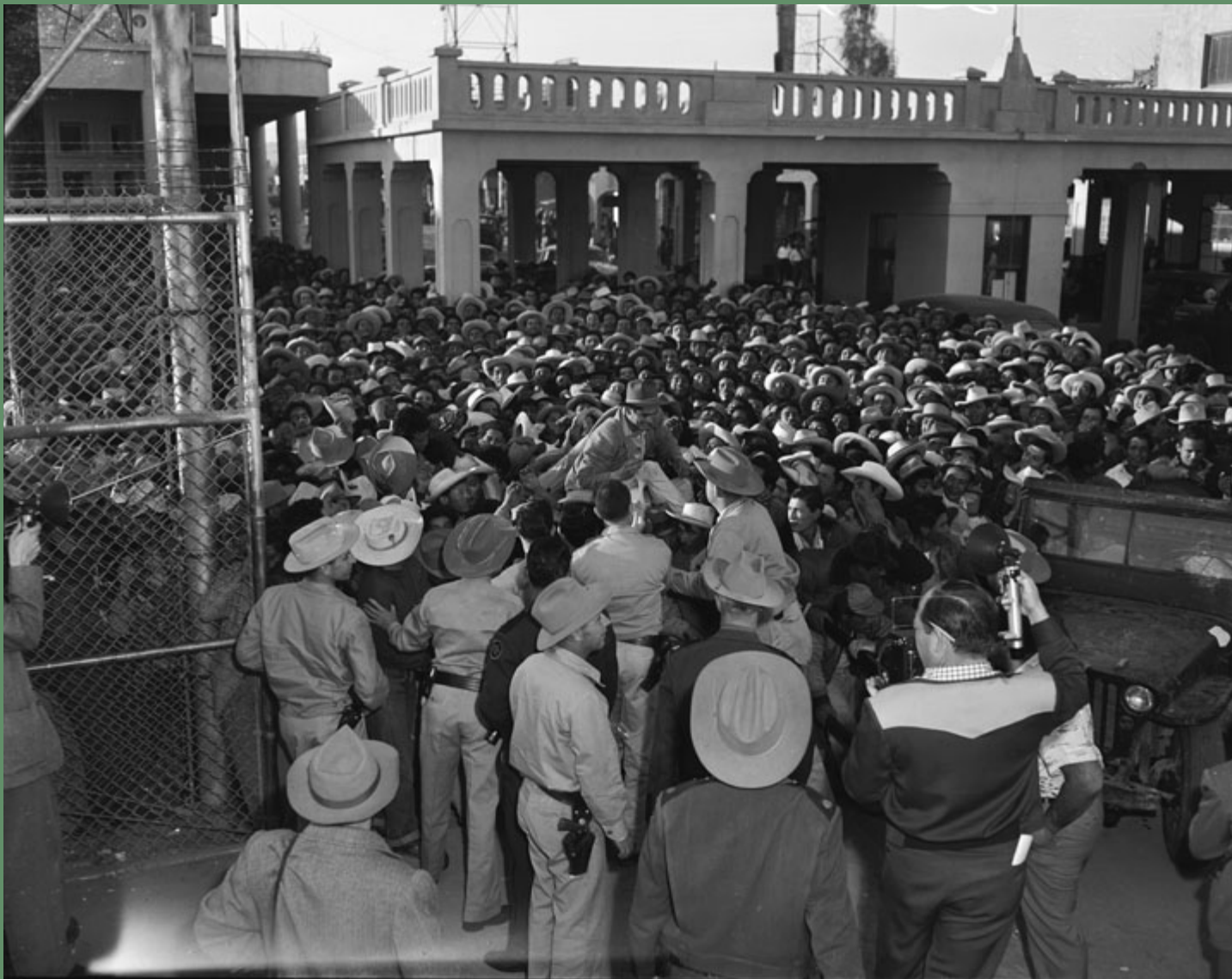
“Mexican workers await legal employment in the United States, Mexicali (Mexico)” - Los Angeles Times , February 8, 1954.