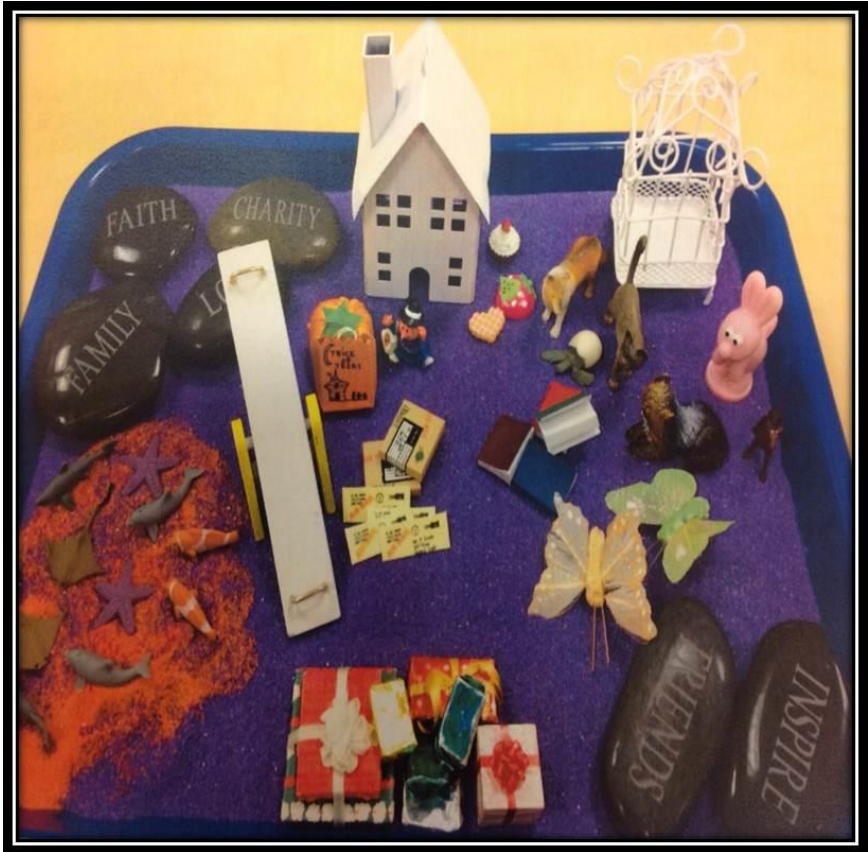
Chloe's Sand Tray