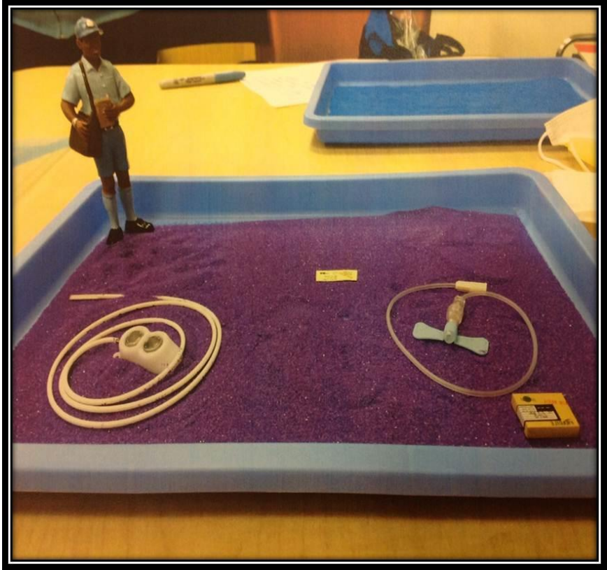
Gabby's Sand Tray: Port