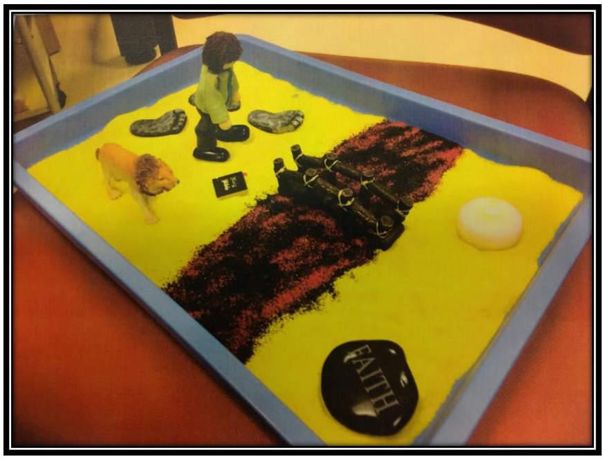
Griffin's Sand Tray: Faith