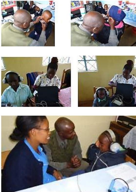
Figure 4: Screening at a Kenyan school

Between 25 and 32 schools (>6000 pupils) are visited each year. Some schools for the deaf are included to identify those who could benefit from hearing aids.