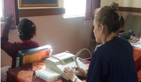
Figure 2: Seating position while conducting pure tone audiometry screening

screening procedures are described below and summarized in Table 3 .