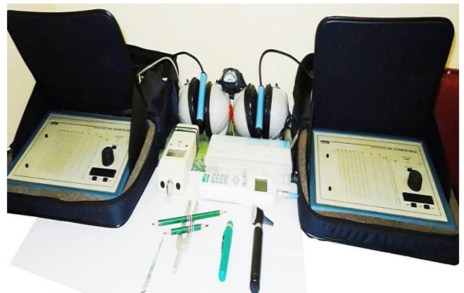
Figure 3: Equipment