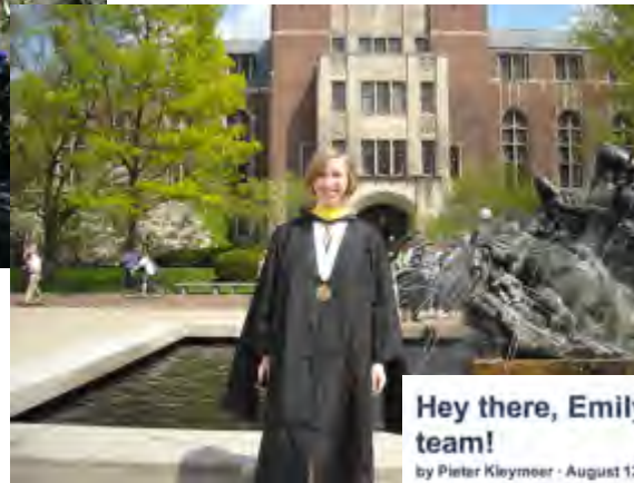
“ Graduation 2010 ”